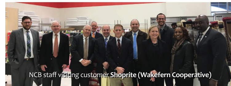
NCB staff visiting customer Shoprite (Wakefern Cooperative)

Cooperatives large and small provide important and valuable services to their members in communities and neighborhoods all across the country.