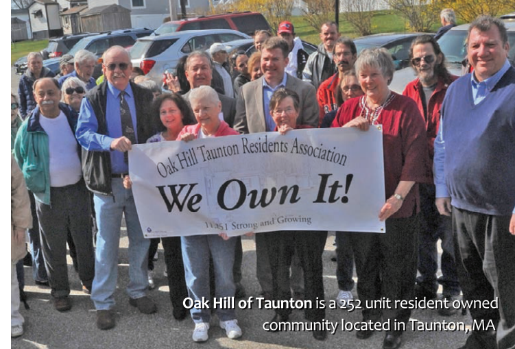
Oak Hill of Taunton is a 252 unit resident owned community located in Taunton, MA